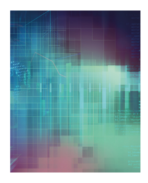
"With its Cisco-based solution, Verizon is simplifying its current configuration for better control of upfront and ongoing management costs."

In the case of wireline networks, data center operators and enterprise network OEMs are developing and deploying platforms that have built-in cloud connectivity, through virtualized software runtimes optimized for the edge.